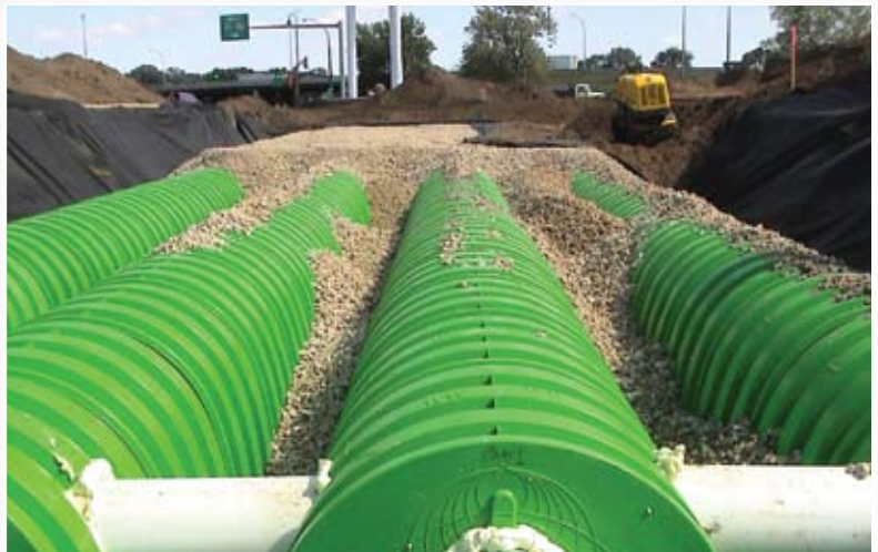
The lightweight and superior engineering of Triton Chambers made installation fast and easy.