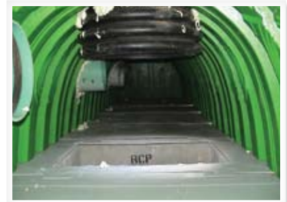
The Triton Main Header Row featured solid floors and an easily maintained sump dumpster.

The Triton storm water system was split into two sections and placed in opposite corners of the parking lot. This design most effectively utilizes the site's drainage patterns in order to collect all storm water runoff from the large site. Phase one of the system in the southeast corner is 4,000 square feet, with a storage volume of 11,000 cubic feet. At 2,760 square feet, Phase 2 of the system will be placed in the southwest corner with a storage volume of 7,100 cubic feet.