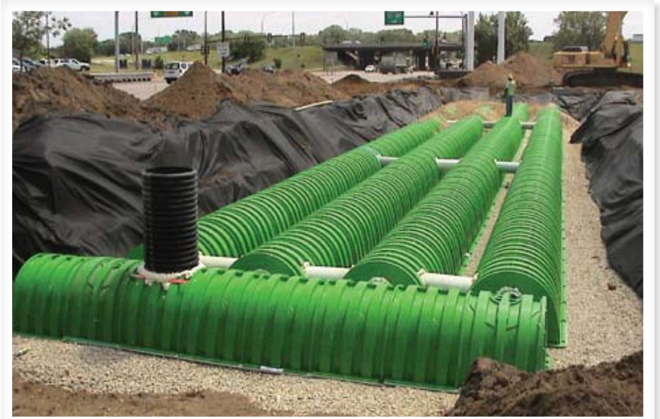
Phase one of Luther Brookdale Chevrolet underground storm water management system will have a storage volume of 11,000 cubic feet.

"The city really liked the Triton system over the others because it had the solid floor in the first few chambers and sump dumpster," says Wallerstedt. "They liked that header row for its easy maintenance."